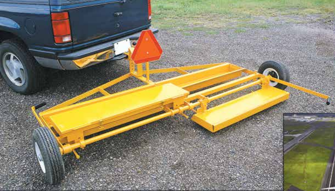
Model MRS172 shown above.