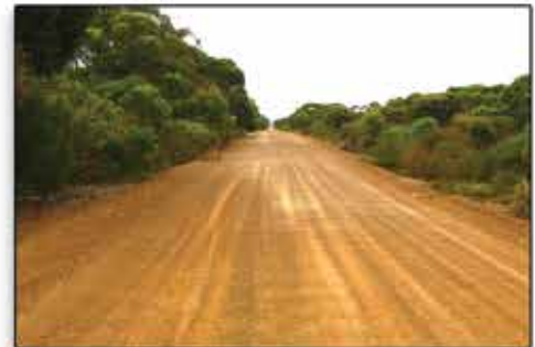
Dirt or Paved Roads

Like the smaller push-type and hang-type models, these heavy-duty pull-type sweepers save time and maintenance costs by keeping areas free of tramp metal debris. The heavy .375" x 2" steel frame with adjustable hitch withstands the roughest conditions. They are designed to operate at road speeds up to 50 mph between jobs, and up to 10 mph during sweeping. Each sweeper has two large, heavy-duty magnets, each has 90 lbs. pull, and feature permanent magnetism with a lifetime warranty. Releasing collected metal is easy too. Simply pull the lever, and the load is released from the stainless steel collecting plate into the carrying pans.