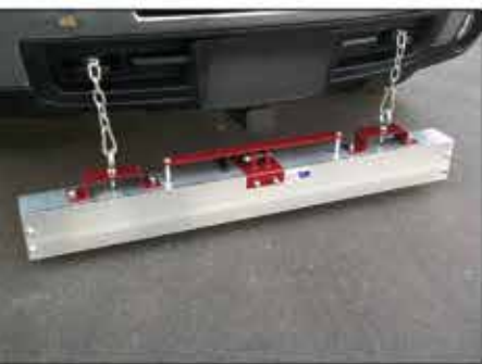
Hang From Vehicle