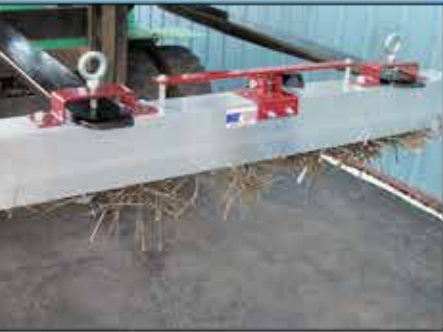
Mount to Forklift