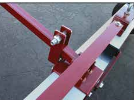
Heavy Duty Towing Bar