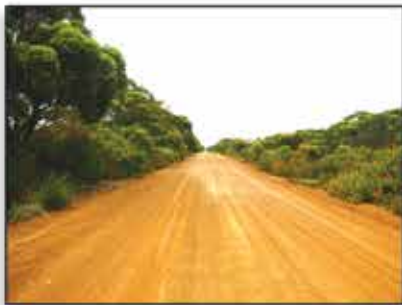
Rural Dirt Roads

Magnetic sweeper applications can be found in a variety of industries, so Master Magnetics offers a wide selection of magnetic sweepers to suit virtually every situation and need.