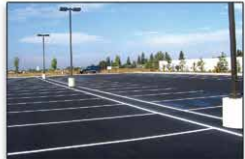
Large Parking Lots

Trailer-type sweepers make a clean sweep on the big jobs. With six or eight foot sweeping widths, they quickly clear tramp iron from streets, construction sites, runways, steel mills, welding sites, and more over smooth or unpaved surfaces, wet or dry! Minimal assembly required.